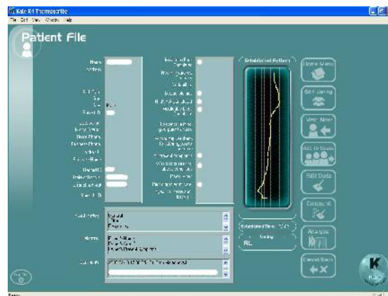
Figure 1. Patient pattern (on right) showing asymmetric distribution of heat.